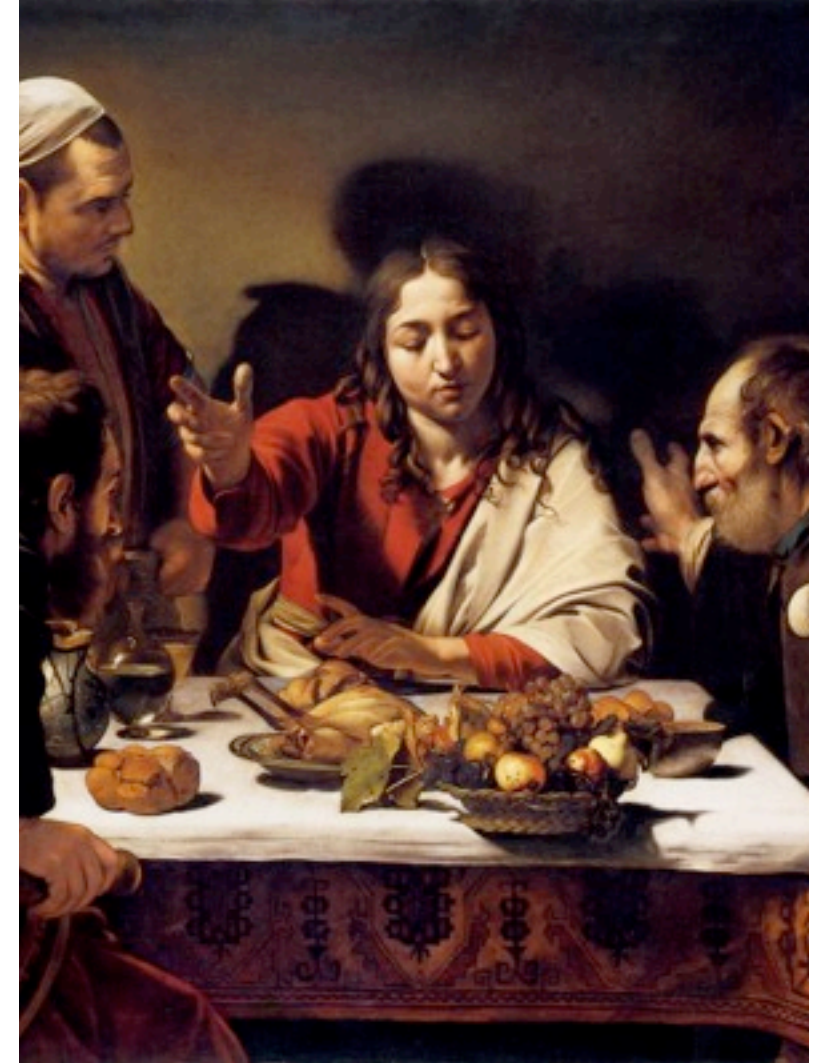
daily life, encountering a stranger, breaking bread