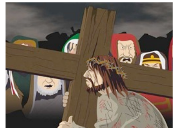
it also looks like this (representations of religious experience)