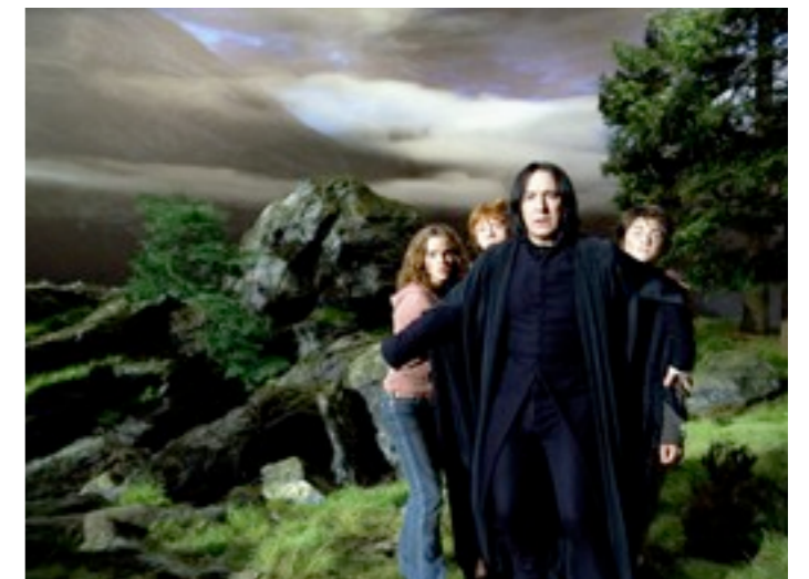
challenges brought by Harry Potter and Twilight (as examples)