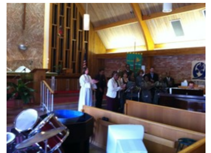
introducing and nurturing communities