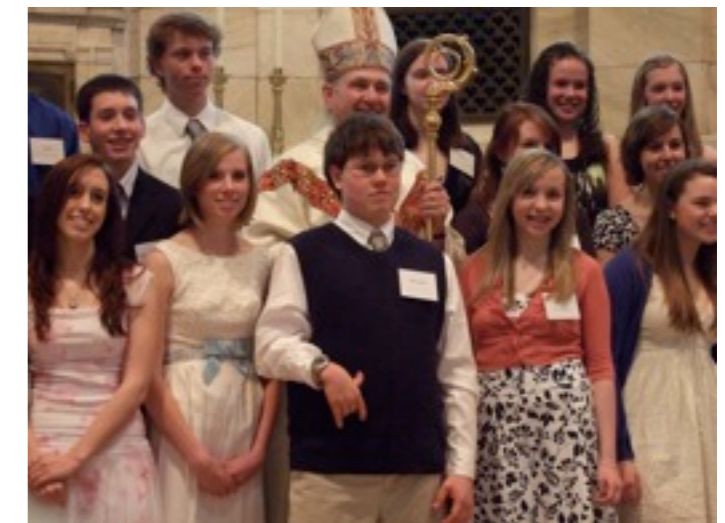
religious experience no longer looks only like this